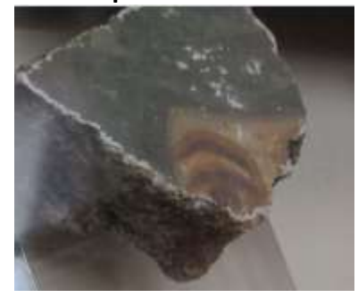
English Heritage Painted Glass from Vindolanda