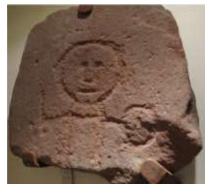
Ring intaglio from TWAM Juno statue from English Heritage Carved figure from Senhouse